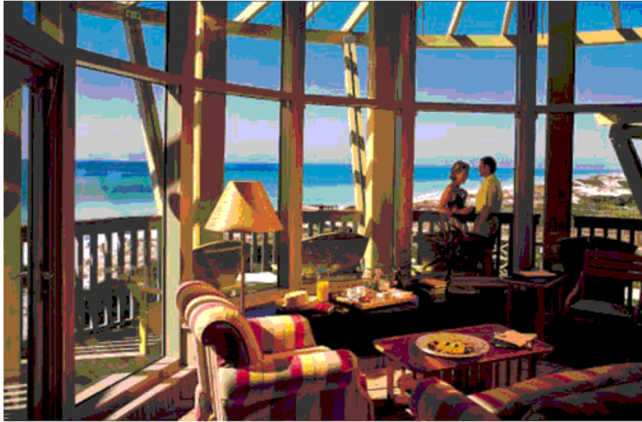
WaterColor Inn was designed to draw new visitors to Northwest Florida.