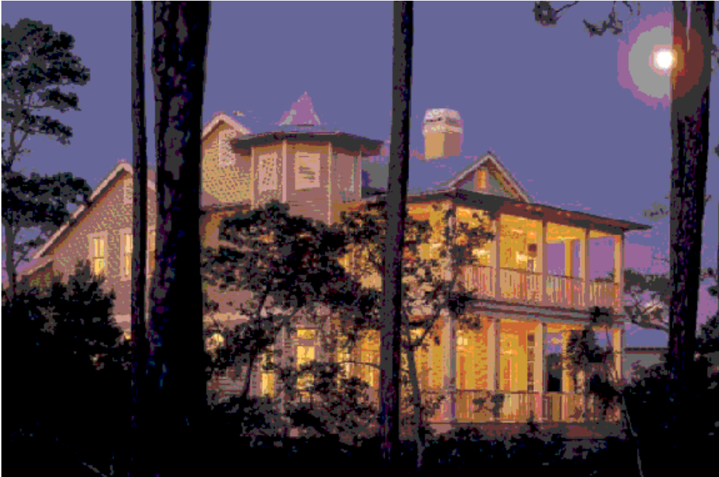
Our community residential development segment, Arvida, develops large-scale, mixed-use communities.