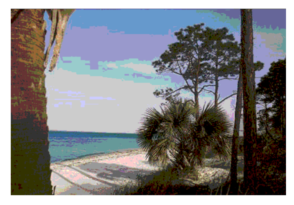
St. Joe's holdings include approximately 5 miles of white-sand beaches, 39 miles of Gulf of Mexico coastline, and hundreds of miles of waterfront on bays and rivers.