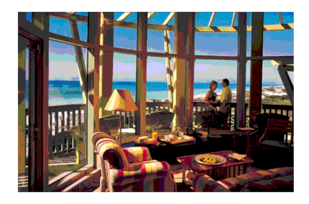
WaterColor Inn was designed to draw new visitors to Northwest Florida.